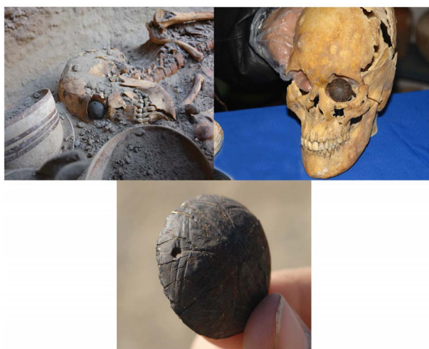
Figure 1. The earliest artificial eye was found by an Iranian archaeologist in Shahr-i-Sokhta, Iran.

The next major step in TE progress in Iran was application and fabrication of scaffolds for TE in the early 2000s. The earliest attempt carry out TE effort was reported in the Iranian Polymer Journal in the year 2000 [14]. It was not until 2000-2010, however, that one began to see more and more researches in this emerging field. This is when many of the pioneers in TE research began to make their mark [15-18]. It is important to consider that the focus of Iranian researchers was on engineering bone and