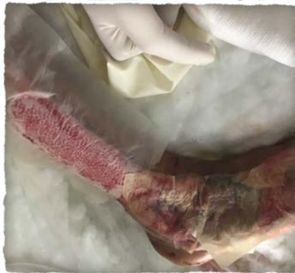
Figure 3. Wound healing with bacterial cellulose-ACT-Nanoskin ® membranes.