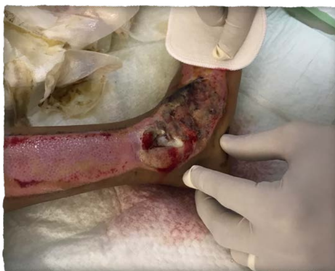
Figure 2. Wound healing with minimal debridement.

Finally, laser CO 2 and Nanoskin ® -ACT membranes complete wound healing process only in two and three months as observed in Figure 5(a) and Figure 5(b) .