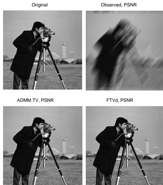
Figure 1. ADMM algorithm for deblurring.