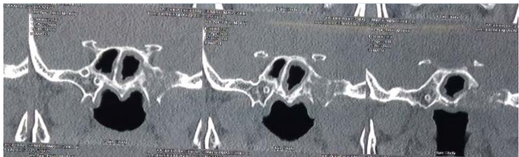
Figure 1. CT scan plain images [Coronal bone cuts] showing erosion of the skull base at the floor of sphenoid and lateral recess.

Intraoperative findings showed disease in floor of sphenoid and lateral recess which was debrided and the tissue was sent for routine HPE/Microbiology and