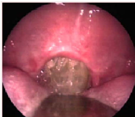
Figure 4. Nasopharyngeal stents in-situ.

Post operatively patient was kept under observation for next two days. Discharged with medications viz antibiotics, painkillers and advised for frequent OPD visits. The tubes were removed in the operating room after three months, after the deflation of bulbs. Nasal suctioning was done and nasal bleed was ruled out.