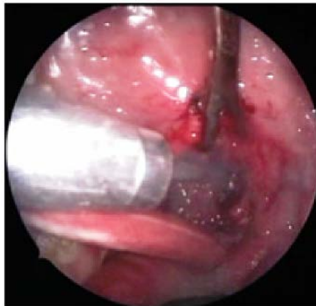
Figure 3. Intra-Operative view.