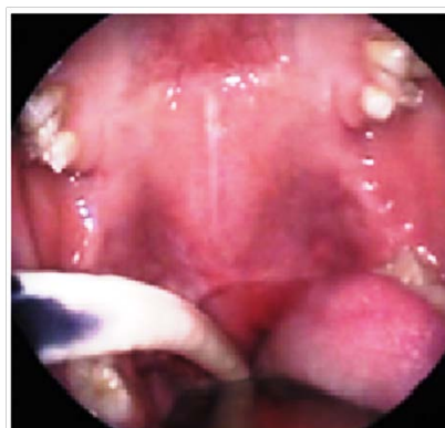
Figure 1. Pre-Operative oral cavity.

Figure 5 shows the two cut ends of the endotracheal tubes used as stents can be seen coming out of the nares. The lengths of tubes were tailor-made as per the comfort of patient. The tubes were left in Situ for the next three months with the bulbs inflated.