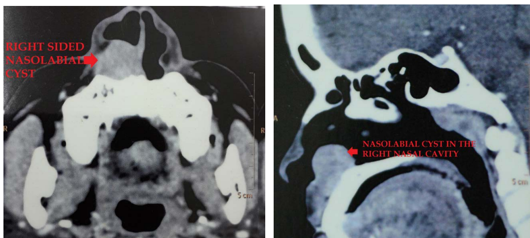
Figure 2. CT scan showing the nasolabial cyst in the right nasal cavity (axial and sagittal cuts respectively).