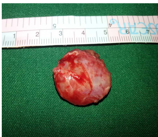
Figure 4. Excised nasolabial cyst specimen.