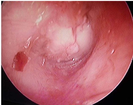
Figure 2. 2 months postoperatively showing take-up of the graft.