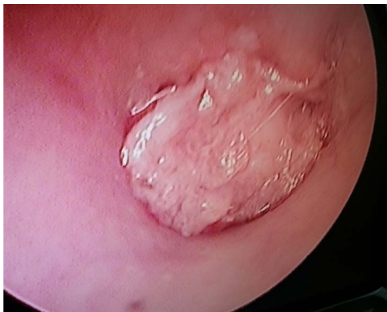
Figure 4. Perichondrium spread in overlay fashion and the cartilage proper placed as an underlay graft.