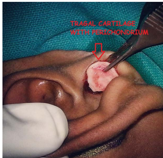
Figure 2. Tragal cartilage being harvested.