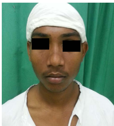
Figure 1. Case of right CSOM.

Gelfoam was kept in the EAC and the postauricular wound closed in layers. Post operative period was uneventful.