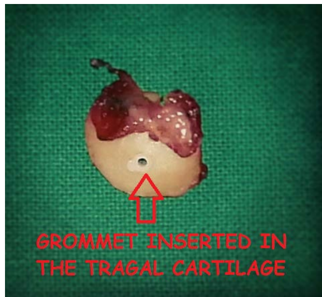
Figure 3. Composite tragal cartilage graft with inserted grommet.