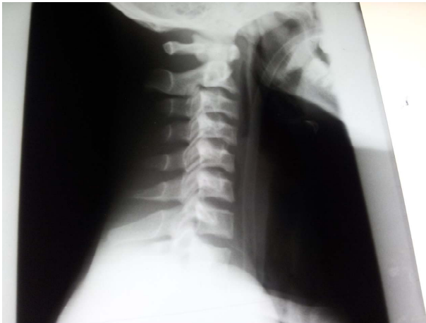
Figure 2. Lateral view, post operative soft tissue X-ray of the neck with nasogastric tube in situ and resolution of the increased prevertebral soft tissue shadow.

level of C4 was reduced to about 20 mm ( Figure 2 ) and no recurrence on follow-up visit.