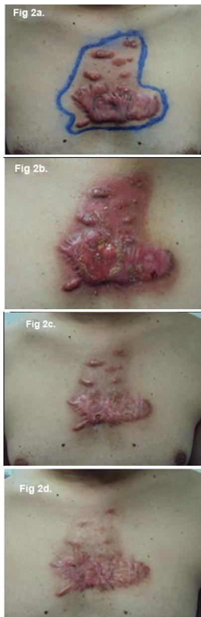
Figure 2. (a) (22.6.2011) shows skin reaction 1 week after first fraction; (b) (21.7.2011) shows extent of skin reaction on the last or the 5th fraction; (c) (12.8.2011) shows extent of skin reaction 3 weeks after last fraction; (d) (31.7.2012) shows 12 months after treatment completed.

Gr3). Figure 2(d) (31.7.2012) shows 12 months after treatment completed. All satellite keloids regressed by 80% of their height and areas to some extent. Main pre sternal butterfly lesion also regressed between 30% and 50% of its height. Erythema remains as slight pigmentation, desquamated areas healed completely, the lesions are softer. Patient keloid symptoms had resolved on completion of his last fraction. He did not feel socially restricted or compromised, felt very happy to return to his social life and commitments.