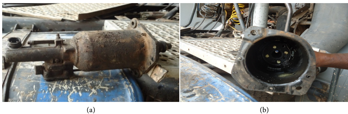
Figure 1. Typical actuator chamber of a heavy duty vehicle. (a) Longitudinal view (b) Cross-sectional view.

The forces or pressures produced in an actuation chamber are sometimes difficult to be measured due to the unavailability of precise instruments to accomplish the task. Faced with such a challenge necessitates an improvised technique that requires experimentation. This is exactly what is explored in this piece. The knowledge of these parameters is important in the study of the actuation process in electro-pneumatic clutch systems of heavy-duty vehicles. Thus, the paper demonstrates an alternative solution for solving critical clutch actuation needs in an