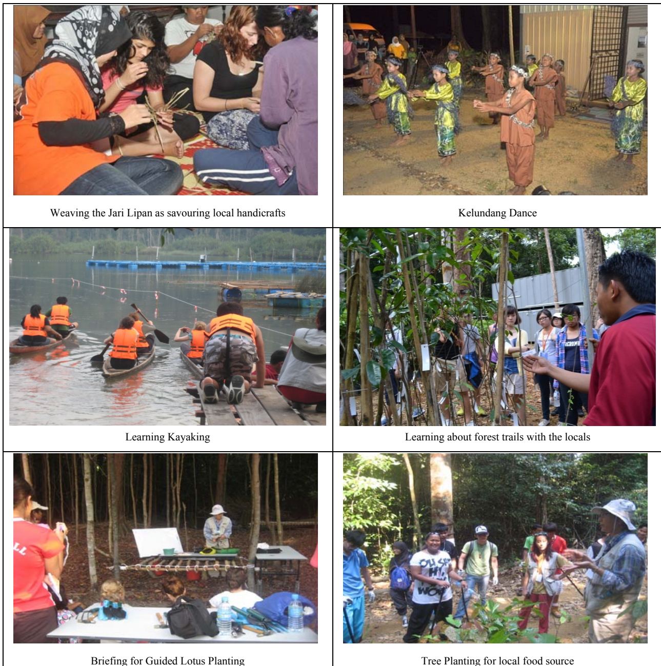
Figure 3. The Cultural Learning at Tasik Chini.

an in-depth study of their characteristics and behaviour. Table 4 shows the major segments of the learning community.