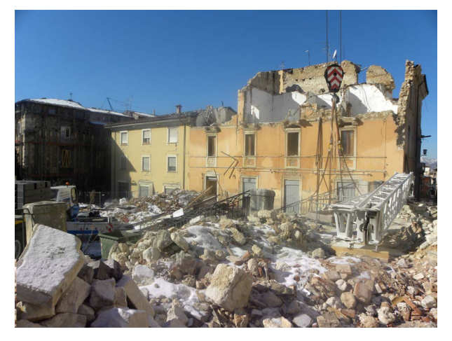
Figure 5. Some buildings near the church of S. Pietro a Coppito in February 2010.

Depending on its local temperature, every material sur-