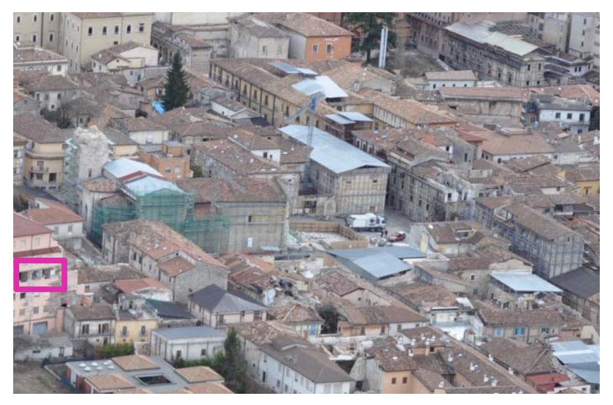
Figure 3. The situation in proximity of the church of S. Pietro a Coppito in March 2012.