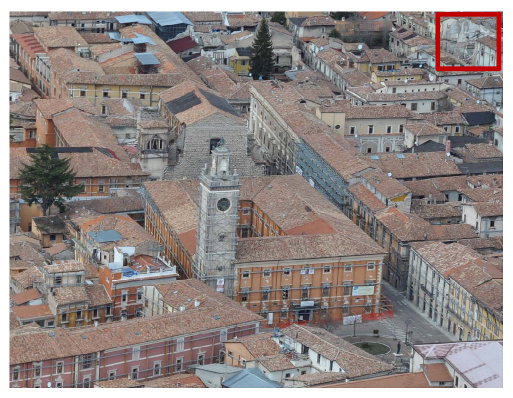
Figure 7. A zoom near Piazza del Palazzo in March 2012.