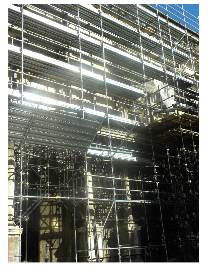
Figure 9. Work of safety measures near Palazzo Madama in February 2010.

minium). Recognition of these structures may be sometimes difficult in visible light imagery, especially when the reflecting nature of the surfaces might not clearly appear. This is often the case when the sky is overcast and the oblique view is not very angled. However, in a geographic research, the ability of reliably recognizing metal roofing can be significant. In the discussed area, in fact, this type of roofing is an important indication that the building is being repaired/reconstructed; or that temporary enclosure from above is being given to a seriously