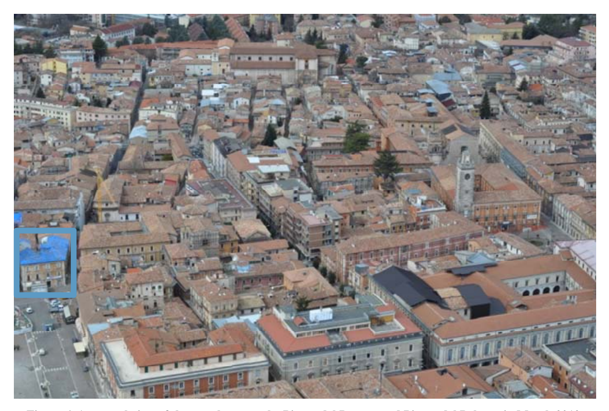
Figure 6. A general view of the area between the Piazza del Duomo and Piazza del Palazzo in March 2012.

even in complete darkness or thick mist. Beyond simple detection, in many cases it is possible to achieve a reliable measurement of the detected temperature by following appropriate protocols.