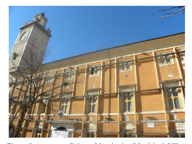
Figure 8. A zoom on Palazzo Margherita (Municipal Office), in Piazza del Palazzo, in February 2010.

minium). Recognition of these structures may be sometimes difficult in visible light imagery, especially when the reflecting nature of the surfaces might not clearly appear. This is often the case when the sky is overcast and the oblique view is not very angled. However, in a geographic research, the ability of reliably recognizing metal roofing can be significant. In the discussed area, in fact, this type of roofing is an important indication that the building is being repaired/reconstructed; or that temporary enclosure from above is being given to a seriously