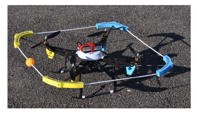
Figure 1. The remote-control helicopter equipped with a digital camera which will be used during the next field study.

L'Aquila town centre continues therefore to appear as a wounded and heavily damaged environment where the time needed for a general re-vitalization is extensive. For example, if we focus our attention on the area near the church of S. Pietro a Coppito, we observe a marked level of damage in a context of neglect without people. In this case, the earthquake, whose effects were enhanced by different factors of vulnerability, provoked severe damage