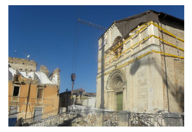
Figure 4. The church of S. Pietro a Coppito in February 2010.

thermographic frames. The procedure is based on the comparison between visible and infra-red light images. In a manual interpretation conducted by human analysts, thermal frames can be used to cross-check the interpretation of visible-light images; however, it would be also possible to perform the recognition directly on the thermal frames and later validate it by referring to the visible light images. This second approach would be more appropriate for an automated analysis process, operating on a large number of images under human operator supervision.