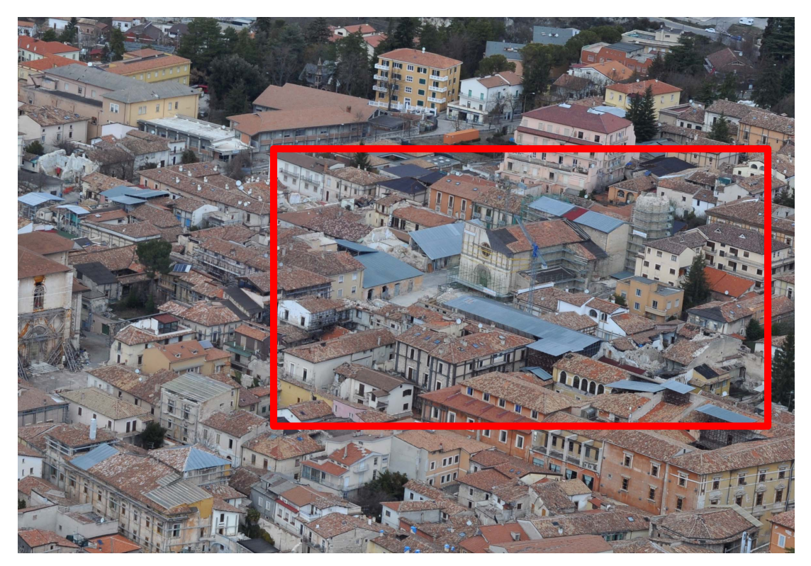
Figure 2. The church of S. Pietro a Coppito and the nearby buildings in March 2012.

As part of the methodology of this research, we tested a specific procedure for the recognition of provisional nonpainted metal roofing of buildings in L'Aquila, as an example of a post-earthquake urban area, by examining