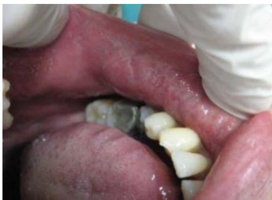
Figure 4. 4 days after treatment.