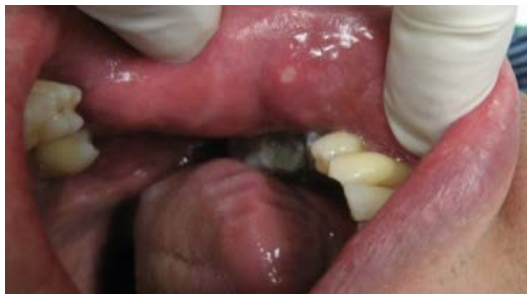
Figure 1. Minor aphthous ulcer.