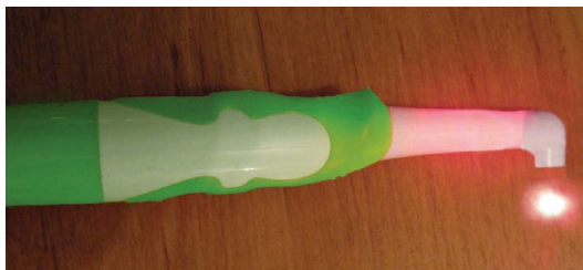
Figure 2. Laser irradiation with aphthous laser pen.