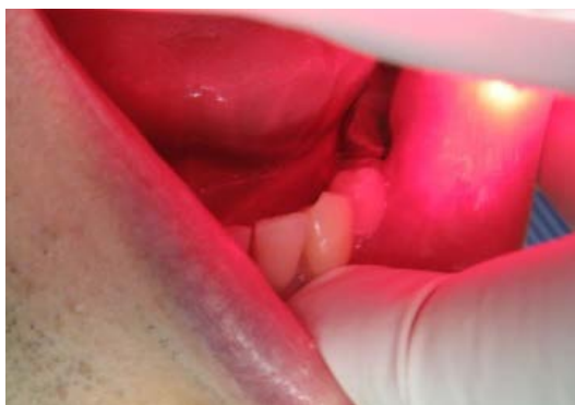
Figure 3. Laser irradiation with aphthous laser pen.

The Research Ethical Committee (REC) approval was adopted with number of ARUMS.REC. 1391023 for this research from Ardebil University of Medical Sciences (ARUMS).