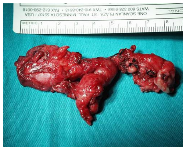
Figure 3. Surgical specimen (plexiform neurofibroma resected).