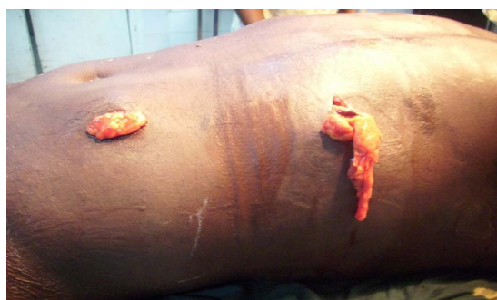
Figure 3. clinical photograph-showing prolapsed omentum (gunshot wound).

The patients were categorized into two groups for management: operative (laparotomy) 25 (86.2%) and non-operative 4 (13.8%). In the latter, the 4 male patients (stab wounds) whose ages ranged from 18 - 27 years (mean 23.5 years) were managed with satisfactory (wounds healed) outcomes. In the laparotomy group (25) patients: one had a negative laparotomy while the outcomes in 21 were satisfactory. The morbidity and mortality profile is shown in Table 3 . The duration of admission ranged from 2 - 19 days (mean 10.5 days). Two (6.9%) patients who suffered stab injuries developed surgical site infection (SSI), this was responsible for increased duration of admission. Three (10.3%) patients inflicted with gunshot injuries that resulted in colonic, splenic/renal injuries had fatal outcome, Table 3 .