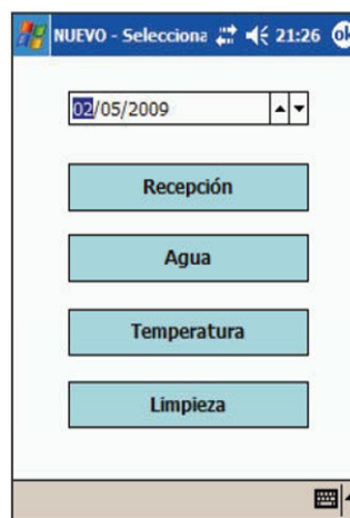
Figure 4. New Record Screen.

for transferring data from the mobile device to the desktop application.