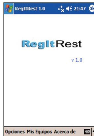
Figure 2. Title Screen.

The project consisted of two applications, one in which mobile data is collected and stored in a database and a desktop on which reports are created. Data is synchronized between the two applications and SD memory cards used