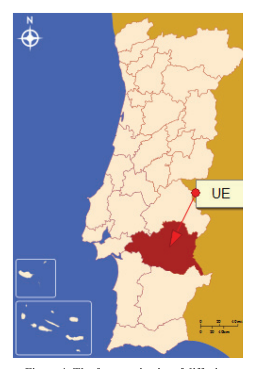
Figure 1. The four territories of diffusion

In accordance to our main goal, it is illuminating to present a figure showing those four territories of diffusion, not only in terms of their location in the country but also in terms of their areas, as both aspects are clearly important in the understanding of the real importance of the spatial process of diffusion of knowledge by the graduates of the University of Évora. Figure 1 thus shows all Portugal, the NUT III Alentejo Central (in red), the location of the UE, and the location of the Alentejo (which is composed by the Alentejo Central and the 4 NUTs III (out of the 5) surrounding the Alentejo Central with largest areas.