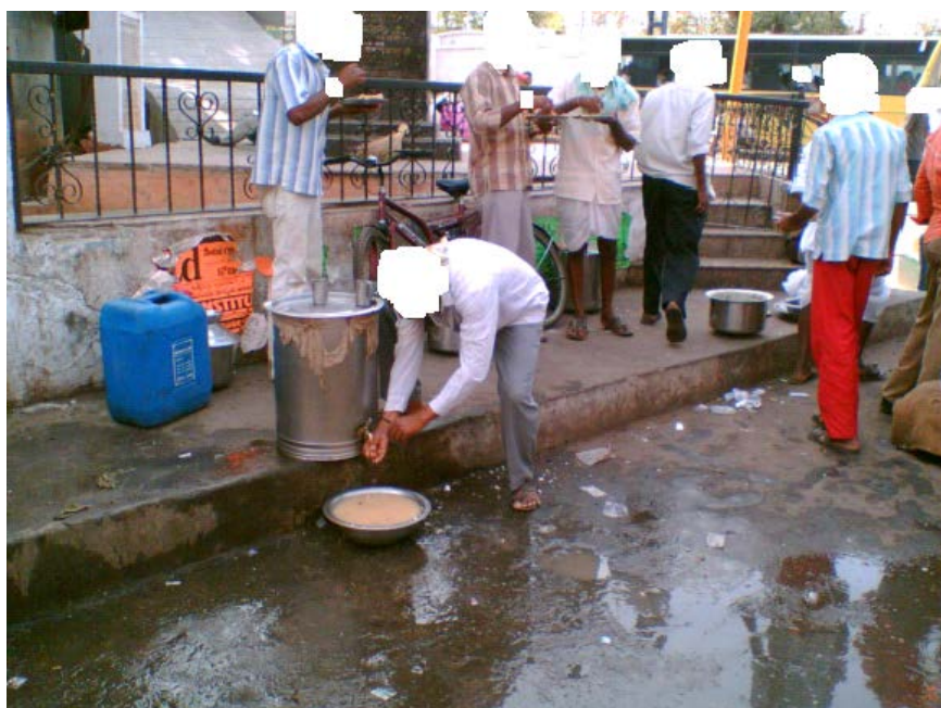
Figure 3. People taking food from street vendor's where the drinking glasses and food preparing vessels are kept open.