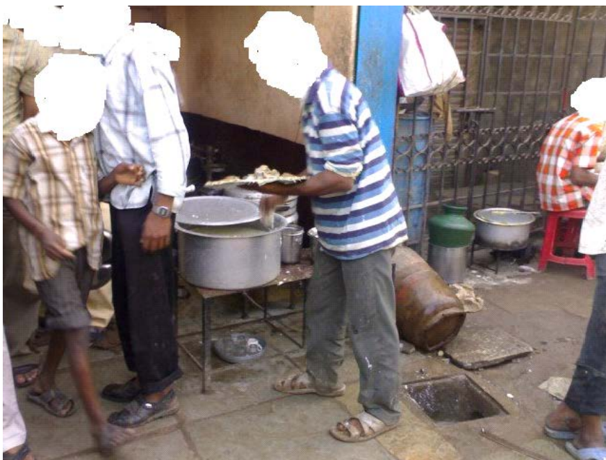
Figure 2. A Worker in food distributing Shop dispensing food items with bare hands with a drain open near it.

lence. The results obtained from our study are quite similar to earlier studies which showed high bacterial count in these food items. The probable reason for this may be poor personal hygiene, extended holding, constant handling and the use of substandard water and apparatus at different stages, as observed in street food practices [28] (Figures 2-4).