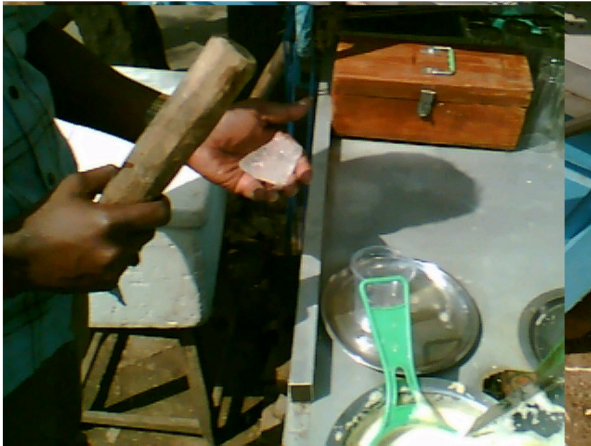
Figure 4. For Preparation of Fruit juices, the ice required is crushed in the hands; this picture is commonly seen during the preparation of food items by street vendors.