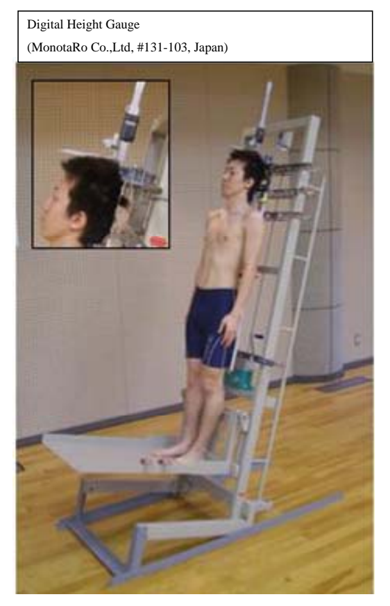
Figure 1. Stadiometer, the apparatus for measuring change in stature.

The stature change was measured using a stadiometer ( Figure 1 ) with a digital height gauge (MonotaRo Co., Ltd, #131-103, Japan) as described by Boocock et al. [14] and Rodacki et al. [18], and followed their meas urement protocol. Subjects remained in a standing position for 2 minutes to minimize the effect of soft tissue creep deformation of the lower limbs [19] in all measurements. The stadiometer was sensitive within 0.01 mm. Measurements were completed when the subject could reproduce ten consecutive measures with a standard deviation of less than 0.5 mm [18], and their mean w a s