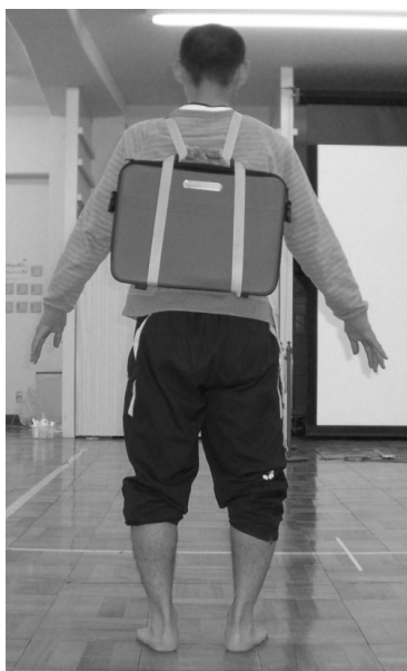
Figure 2. The varying weight loads on the subjects.

F1: movement, F2: loads, F3: interaction, * : p < 0.05 , ascent: stair ascent, descent: stair descent, level: level walking