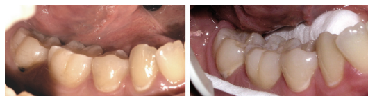
Figure 3. Initial white spot lesion (teeth 43 and 45) and brown spot lesion (tooth 47) in a young female patient, (a) start of non-invasive treatment with the daily bioavailability of fluoride by F-containing dentifrice and F tablets (1 mg p.d.), (b) clinical control over 5 years demonstrating reversals of the white spot lesions in canine and premolar and decreased but stable molar lesion.