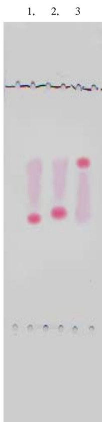
Figure 2. Paper electrophoresis ran (1: ASA, 2: BSA-Gra.S, 3: Gra.S).

result of this research we may be able to prepare Gramicidin (S) immunocomplex to obtain specific antibody, which could be depended in preparation of specific diagnostic kit. These methods are non expensive and thus it is standard practice to test only pre-screened individuals rather than, for example, mass-screening of patients upon admission to hospital. Apart from the (very expensive) DNA testing methods, all of the known methods require pure cultures of bacteria which have to be obtained from the individual and then grown over at least 48 hours prior to testing. This means that these known tests cannot be used to obtain rapid results which would allow infection control measures to be implemented at the earliest possible opportunity. The process could be applied to other antibiotics which have composed of amino acid.