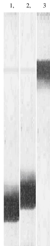
Figure 1. Cellulose acetated paper electrophoresis ran (1: ASA, 2: BSA-Gra.S, 3: Gra.S).

Figure 2 showed previous result using a paper electrophoresis. It was also stressed the state of the link through the complex nature consisting compared with both free