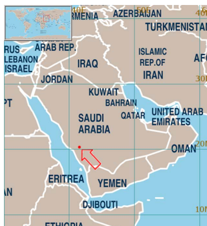
Figure 1. The study area (Al-Baha region—Saudi Arabia).

The collected water samples were acidified with nitric acid to avoid the collection of organic materials, then each sample was filled into 500 ml capacity polyethylene Marinelli beakers (IAEA, 1989). Before use the containers were washed