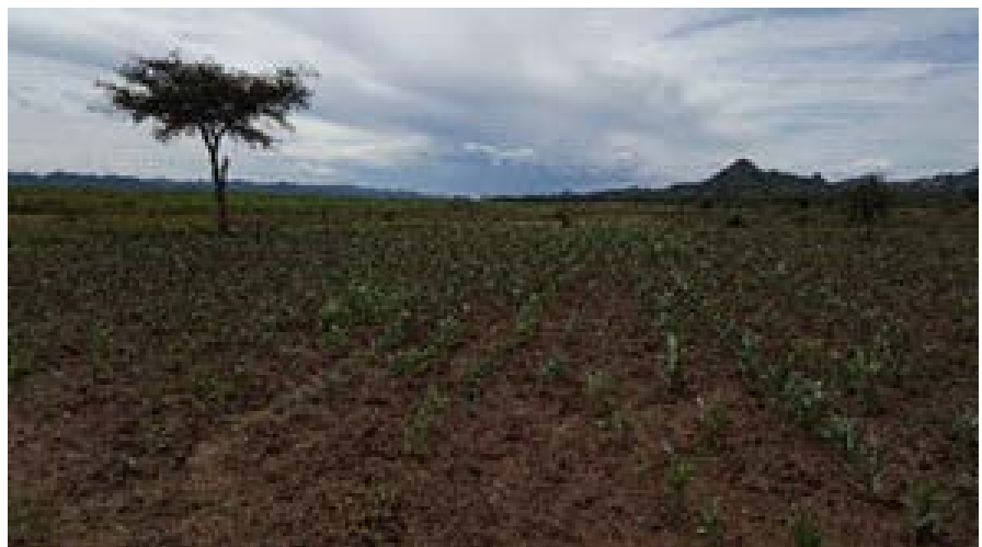
Figure 3. A maize plantation in the wetland.

As shown by similar studies undertaken by Musamba et al. (2011), the current study identified livestock keeping as a major economic activity in the Mara