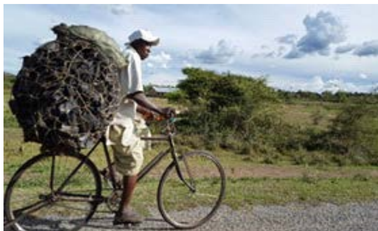
Figure 4. Charcoal being transported to the market using a bicycle.

Papyrus is a major source of income for many locals in African wetlands (Van Dam et al., 2014). It is quickly processed into mats which are popular in the local markets due to their low prices and practicality in use in almost any household's setting (Figure 5). In this study, it emerged from the different sources of information that papyrus harvesting from the two wetlands was happening rapidly and in unsustainable manner due to low mat prices in the markets. This leads to the loss of papyrus and habitats for various herbivorous species such as situnga ( Tragelaphus speki ) and hippo ( Hippopotamus amphibious ). Among the respondents interviewed, makers were the majority at 31%, yet they were the group