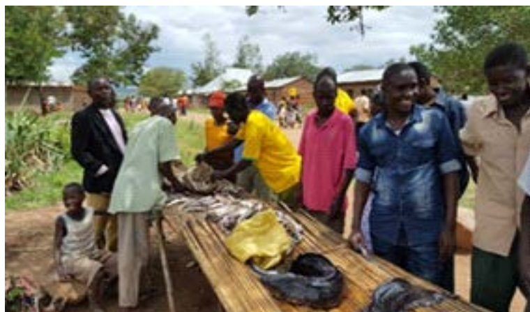
Figure 6. A fish trader serves customers at Kirumi market.