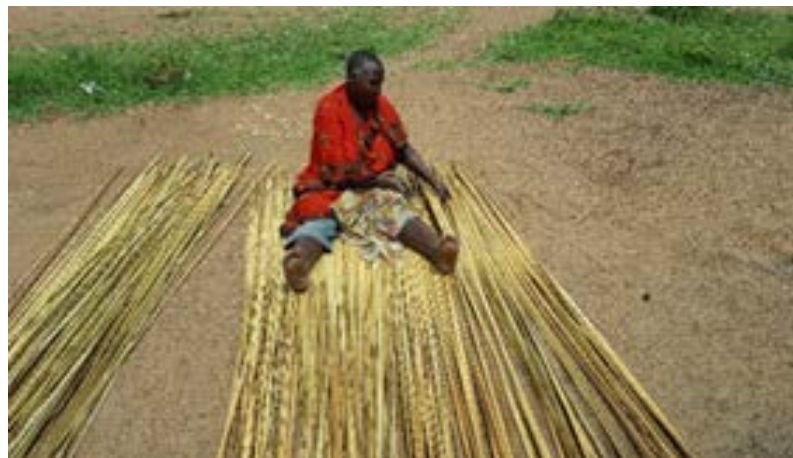
Figure 5. A resident using papyrus to make mats for sale.

An economic activity which was only identified during the field work and was never anticipated was brick-making. In this activity, the top soil is used to bake clays into bricks and this is what causes a challenge in the management of wetlands in the region. The soils in the wetlands soils are known to sequester carbon