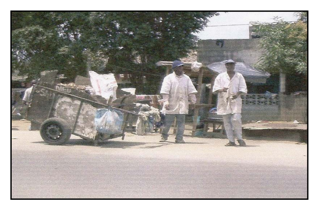
Photo 5. Precollectors deprived of household waste in service with their cart (wottro). Credit of photography: Coulibaly Sita, 2006.