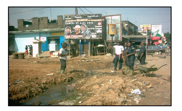
Photo 3. The brigade of healthiness in height sanitation works at the level of the ex-street princess to Yopougon. Photography: Adomon, August, 2010.

In front of the failure of service providers and the municipal officers, the new actors set up a mechanism of pre-collection which integrates a financial contribution on behalf of the households and the users against the service of collection of garbage to Yopougon. It is about precollectors of garbage acting upstream by hawking. These independent precollectors subdivided the municipality of Yopougon into eight zones of bulkings of pre-collected (Figure 1).