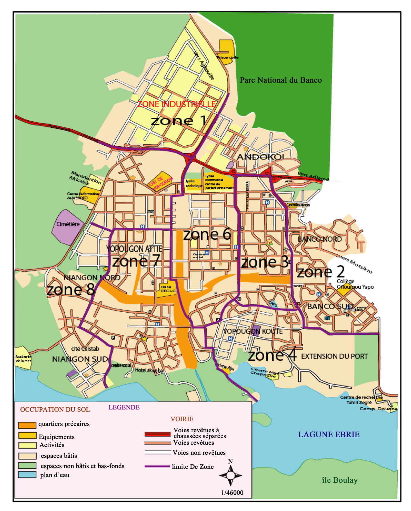
Figure 1. Identification of the zones of bulking of the garbage housewives to Yopougon. Realization: Ané, 2013.