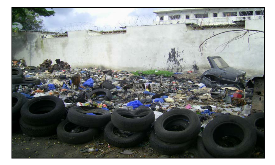
Photo 1. The closeness of a house to Yopougon transformed into garbage dump of household refuse.

In a general way, 69% of the questioned heads of the household consider that since 2002, the municipality of Yopougon is very dirty. Indeed, since the release of the military political and civil crisis, we attend neglected progressive operations of cleaning of the city of Abidjan; what favors the accumulation of wild deposits of garbage on public places today. He in follow-up unsightly one landscaped and an increasing degradation of the living conditions of the populations [9] coach the operation "Clean City" committed by the government since 2009 was not able to freed the economic capital and his neighborhood of waste yet. Consequence, the pre-collection, the collection and the evacuation of the garbage establish a major challenge to be at present raised in Abidjan. The reasons are multiple.