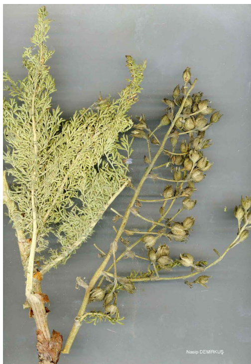
Figure 1. Biebersteinia multifida DC. (Geraniaceae) is a common herb known in Iran as Adamak.

The normal function of CK in cells is to add a phosphate group to creatine, turning it into the high-energy molecule phosphocreatine. During the process of muscle degeneration, muscle cells break open and their contents find their way into the bloodstream. Because most of the CK in the body normally exists in muscle, an increase in the amount of CK in the blood indicates that muscle damage has occurred or is occurring. LDH catalyses the interconversion of pyruvate and lactate. Exercising muscles convert Glc to lactate. Lactate is released into the blood and is eventually taken up by the liver. The liver converts lactate back to Glc and releases Glc into