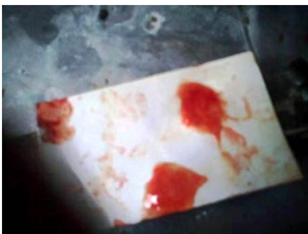
Figure 2. The mucus plug on a filter paper after removal from trachea.

results were negative for psychotropic, antidepressants and sedatives drugs, as well as for other organic nitrogen toxic xenobiotics. The search for ethylic alcohol and other volatile organic solvents ( i.e. : ethylic ether, chloroform, petrol, etc.) was negative too.