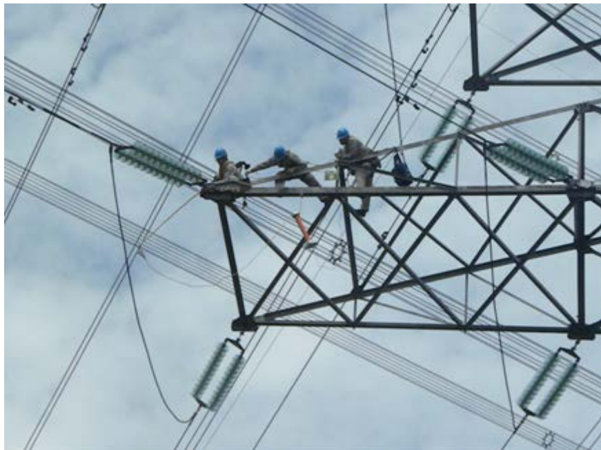
Figure 3. Induced voltage and current of crossing lines in field measurement.