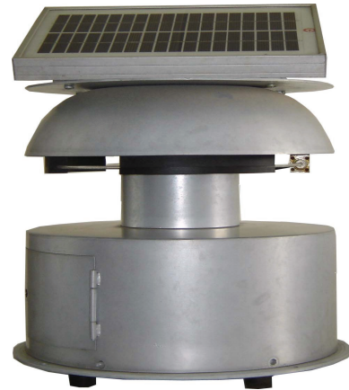
Figure 2. Optical sensor system for the ESDD monitoring of transmission equipment

On the basis of the model principles and modeling steps in the text, Matlab 7.0 is adopted to write the ESDD prediction programs based on WNN. References [4–7,9] show there is a close relationship between insulators ESDD and meteorological factors. So, for each single model, 120 samples of the historical meteorological data and ESDD data provided by ‘‘Optical Sensor System for the ESDD Monitoring of Transmission Equipment’’ (developed by Wuhan High Voltage Research Institute and Wuhan Kangpu Changqing Software Company) installed on the ESDD monitoring spot of Qingshan District, Wuhan, from April to June in 2006, are regarded as training set and forecasting set, where 90 samples belong to training set, and the rest 30 samples to test set. Table 1 shows the comparisons between WNN combination forecasting model and LCF, MLR, BP and LSSVM.