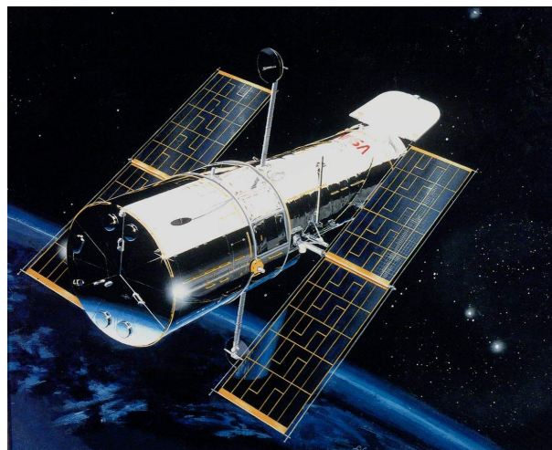
Figure 2. Hubble Space Telescope [3] [4].