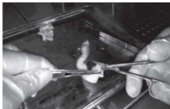
Figure 1. Segmentation of the umbilical cord from Wharton's jelly.

This study, for the first time, investigates the amount of bone produced by autogenous bone tissue engineering. The results of the study indicated that although autogenous bone graft still has a golden standard of treatment for bone defects,