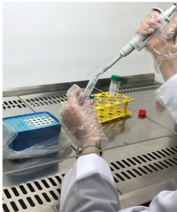
Figure 3. Prepare a suitable culture medium.