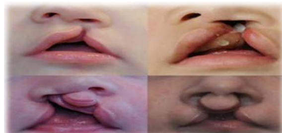
Figure 4. Procedural Treatment in Children Examined.

including the alveolar gap, now it is the usual way to treat these abnormalities by using another part of the body, such as the pelvic bone, leg or rib. It has side ef-