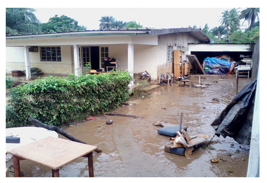
Photograph 5. Flood of a house after a rain in Bonoumin-Est.

These posters stuck confusedly, degrade the landscaped esthetics of the urban space and are source of insalubrity. When comes a bad weather, these posters are removed by the rain or the wind, leaving ungraceful tracks dirty.