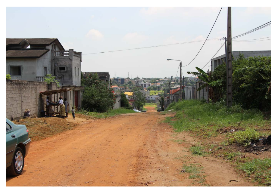
Photograph 3. An unfinished construction the shop window of which is transformed into space of retail trade by the occasional occupants.

As in most of the districts of Abidjan, Riviera-Bonoumin escapes the proliferation of wild deposits garbage. Streets, crossroads and gutters are blocked by plastic waste coming from the small shop and from the household waste (Photograph 4).