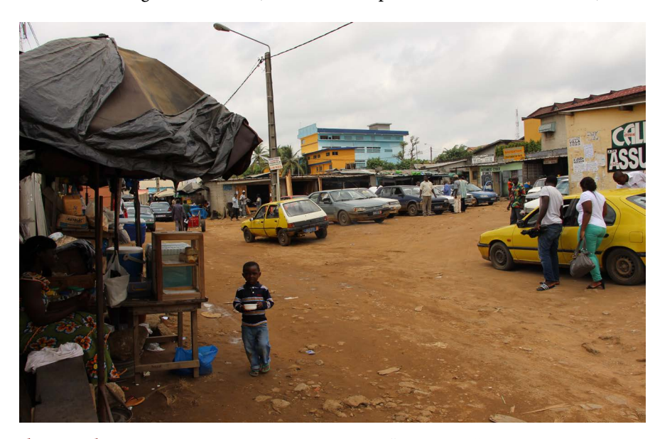
Photograph 1. Watch the entrance of the station of "wôrô-wôrô" of Bonoumin. A cohabitation with the small business of detail.

These housing environments (Photograph 2(a) and Photograph 2(b)) are built with salvaged materials (Boards, some plastic and old sheet steels). The