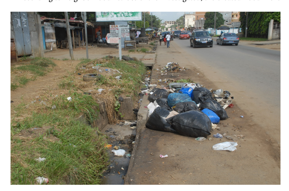
Photograph 4. A gutter blocked, narrow-minded and filled by waste to Bonoumin-Est. In the closeness, the heaps of garbage put down on public roads.

According to neighborhood 28.23% of the investigated, the created flood more