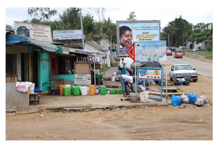
Photograph 6. Anarchy arrangement of posters and panels in the crossroads 9 kilos.