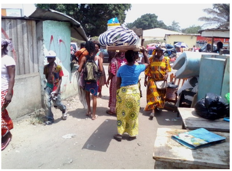
Photograph 7. Operation of forced displacement of spaces illegally busy near the crossroads. Commissionership and in 9 kilos.