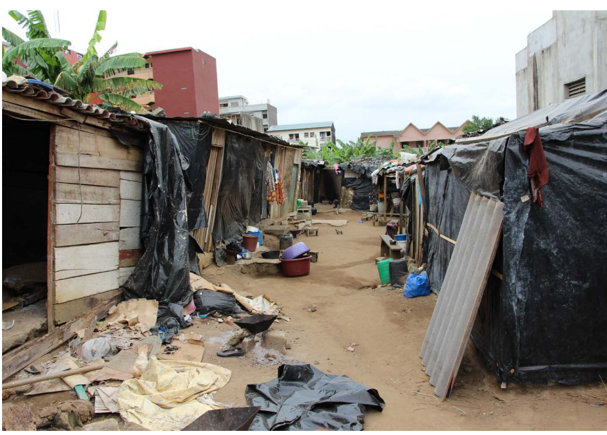
Photograph 2. Not built Spaces and precarious housing environments to Bonoumin-extension. These images show not built spaces transformed into home of housing environments precarious and in garbage dump under banana trees on the other hand.