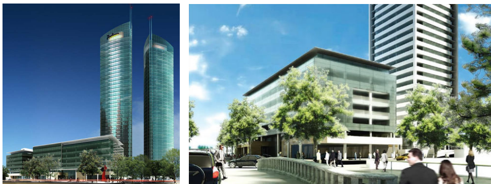
Figure 1. Capitalinas complex in Córdoba city.

It is worth mentioning that Capitalinas venture has a form of real estate development, where the modification in the project is permanent, in response to changing market demand. This situation has made a significant trend in the new scenarios of local private development. The project is divided into three stages: The first stage covers office buildings for corporation, with a parking for 330 vehicles, a commercial-gourmet area in the ground floor, locals for banks, a gym, spa, natatorium and the building of the convention center. The second stage involves the construction of a Condo-Hotel Radisson, in an international format. The third and final step is the residential area, which has also been modified from the original proposal (Marengo, 2010).