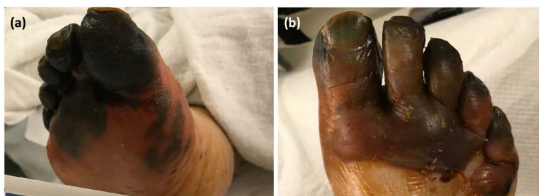
Figure 1. Severe cyanosis of the right forefoot spanning the digits to the metatarsal heads on the plantar (a) and dorsal (b) aspects of the foot. Fluid-filled bullae on the dorsum of the forefoot.