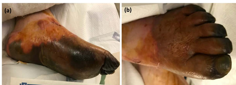
Figure 2. Severe cyanosis of the left forefoot and midfoot extending over the left ankle plantar (a) and dorsal (b) aspects of the foot. Fluid-filled bullae on distal, lateral foot.