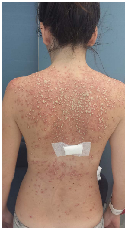
Figure 2. Monomorphic pustular folliculitis suggestive of actinic superficial folliculitis over the back.

follicles infundibulum and sebaceous glands. Bacterial cultures were negative, ruling out Staphylococcus aureus folliculitis. Fungi were not identified on periodic acid-Schiff staining and cultures. Polymerase Chain Reaction of HSV and VZV in biopsy were negative. Blood cultures were also negative.