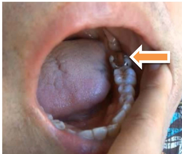
Figure 4. The inlay (arrow) was placed in the left lower second molar.