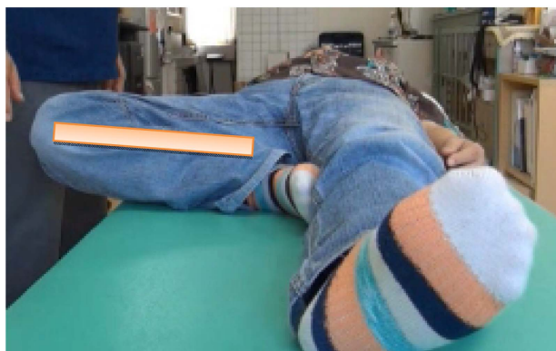
Figure 5. The angle between the bed and the subject's lower thigh was almost 0^\circ on placement of the inlay in the left lower second molar, and the subject felt neither pain nor stiffness in either of his hip joints.