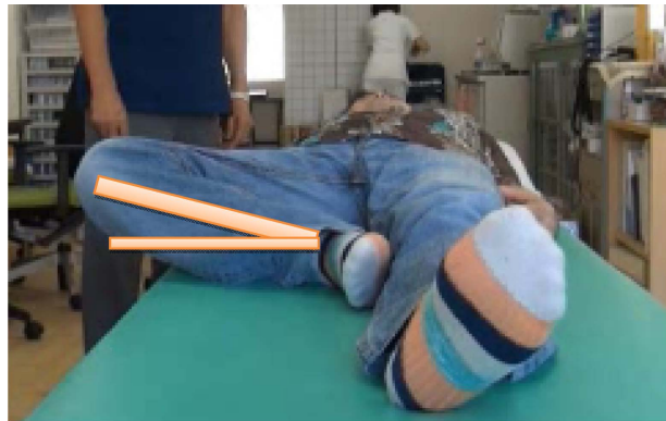
Figure 3. When the inlay was placed on the subject's chest (not seen in this figure), the hip joint revealed greater flexibility, and the angle between the bed and the lower thigh was approximately 5^\circ . However, some stiffness and pain still remained.