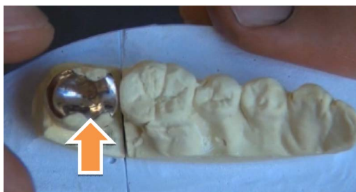
Figure 2. The gold alloy inlay (arrow) that was judged to be effective by the Bi-Digital O-Ring Test.