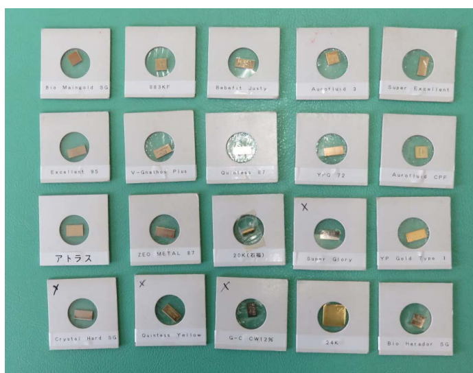
Figure 6. The metal samples. The best metal to make the inlay was selected from these metal samples.

A gold alloy inlay was used to treat the subject's hip joint symptoms, such as pain, tension, and restriction of joint movement, and no side effects were observed. This result may be explained either by the unique electromagnetic waves emitted by the inlay or by the restoration of biting conditions. Thus, a simple dental treatment,