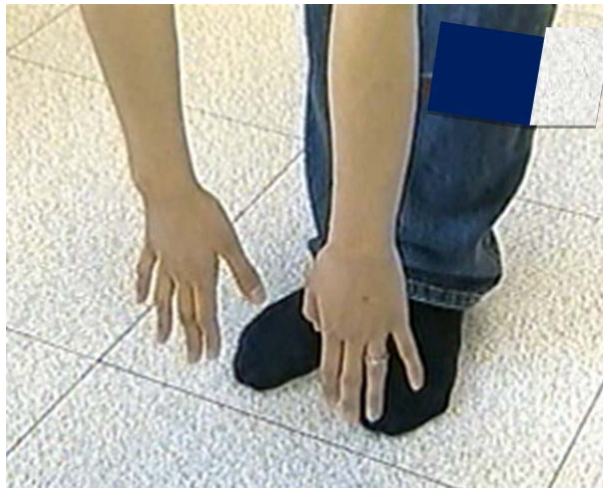
Figure 1. The subject could not bend forward and touch the floor with her fingers. The distance between the floor and her fingertips was approximately 5 cm.

The sharp buccal surface of the left lower second molar was considered to be harmfully stimulating the buccal