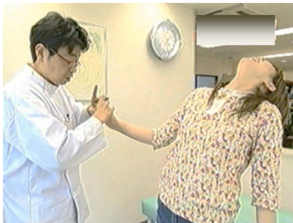
Figure 2. The subject presented with a decrease in grasping power while leaning backwards. So, her O-ring opened.