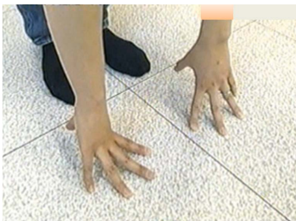
Figure 7. Soon after this simple treatment, the subject could easily bend forward and touch the floor with her fingertips.