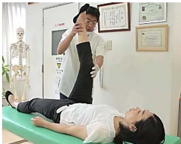
Figure 13. The subject did not feel any tension or pain when a right leg SLR (Straight Leg Raising) test was performed after the treatment. The subject's right leg was able to be lifted up to an angle of approximately 90 degrees.

with balance dysregulation while opening of the mouth results in stretching and pulling of the mucous membrane inwards. The mucous membrane may have been stimulated by the buccal surface. This may also explain the occurrence of the same symptoms when pressure was applied to the subject's cheek. Balance dysregulation due to the stimulation of the buccal mucosa may have been the cause of lumbago in Case 2. The O-ring was easily opened in almost all cases including present two cases when balance dysregulation occurred. However, the mechanism by which this occurs is still unclear. The author thinks that there may be areas like "reflective areas" of reflexology [14]. The harmful stimulation of these areas in the mucous membrane may affect the brain, resulting in this phenomenon. In several patients, the cause of lumbago is unknown. This study provides evidence that dental issues may be one of the causes of this condition that can be treated effectively. Academic cooperation between the dental and medical fields will aid in a better understanding of this phenomenon. Further evidence is required to spread out this treatment widely.