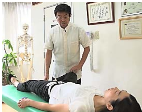
Figure 10. The subject complained tension and pain when her right knee was abducted.