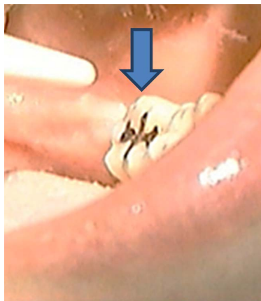
Figure 5. A sharp edge located on the buccal surface (arrow) of the left lower second molar was considered to be causing lumbago in the subject.