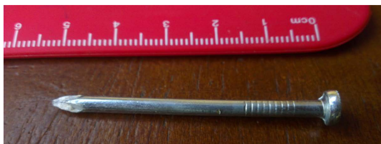
Figure 3. Concrete nail removed from patient's right main bronchus.

asphyxiation by ingested objects; accounting for approximately 3000 deaths per year [15]. The associated morbidity in survivors of prolonged asphyxiation is considerable.