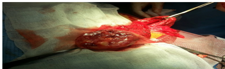
Figure 1. Mass developed at the expense of the spermatic cord.

Chemotherapy, on the contrary, has not proven its efficacy on these tumors [9] [11]. Liposarcoma evolves slowly; it is rather dominated by the frequency of relapses reported in 50%. This supports the need for local monitoring which could be prolonged [9].