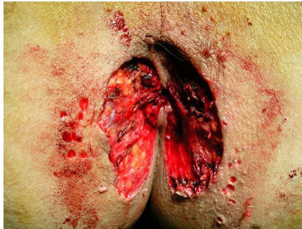
Figure 2. Extended excision of mass verrucous mass.