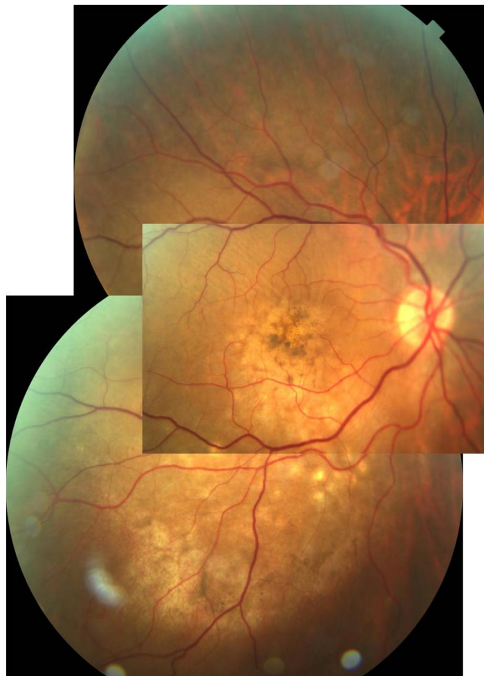
Figure 1. Retinography that shows the aspect of the right fundus of the patient at her arrival to the consultation: yellowish choroidal mass on the inferior temporal arcade that measured 11 \times 7.5 millimeters in base, surrounded with exudative retinal detachment that was causing microfolds in the macula.

A 58-year-old woman who was complaining of metamorphopsia was referred to our clinic. Her personal history was a left breast carcinoma treated 2 years before with radical mastectomy + lymphadenectomy, chemotherapy and EBRT, with complete remission. At present she had multiple bone metastasis so that she was in the second cycle of systemic treatment with taxol and bevacizumab. The ophthalmic examination showed a visual acuity in right eye (RE) of 0.05 and 1 in left eye (LE), and the ophthalmoscopy revealed a yellowish posterior choroidal mass centered on the inferior temporal arcade that measured 11 \times 7.5 millimeters in base. That mass was surrounded by exudative retinal detachment that was causing microfolds in the macula, and that was responsible of blurred vision (Figure 1). B-scan showed choroidal thickening measuring 11.7 mm in base and 2.5 mm in thickness with associated retinal detachment. A-scan showed moderate to high internal reflectivities with absence of calcium. The diagnosis of choroidal metastasis was made.