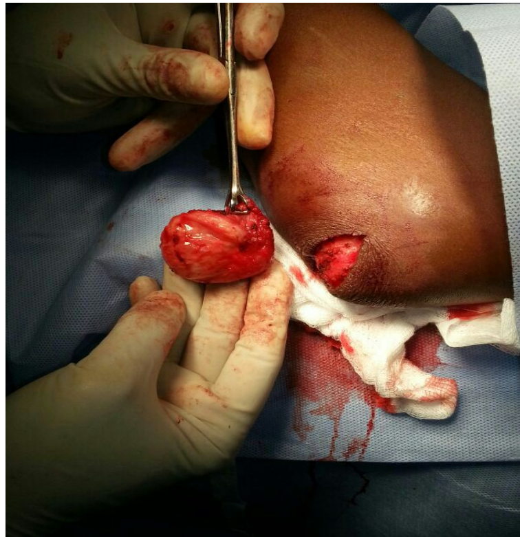
Figure 3. Complete excision of the left olecranon bursa.