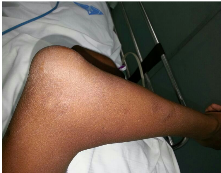
Figure 1. A photograph of the left elbow showing a well defined swelling overlying the olecranon.

Olecranon bursitis can be classified as aseptic (chronic) and septic (acute). Aseptic olecranon bursitis is more common and is usually a result of repeated, low intensity trauma to the elbow as seen in miners, students, carpet-layers, book-keepers and gymnasts [3] [4]. Other rarer causes include systemic inflammatory processes like