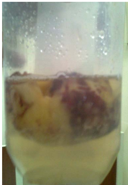
Figure 2. Operative specimen.

Pathology: Atrial myxomas are benign tumours. Two thirds of them arise in the left atrium. Other locations are right atrium (next commonest), ventricles, superior vena cava or pulmonary veins. In 5 percent of cases, myx-