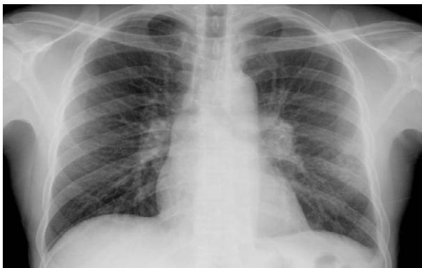
Figure 1. Chest roentogram—left hilar opacity suggestive of lymph node enlargement.

The patient underwent upper endoscopy revealing mild esophagitis and duodenitis with nematodes most suggestive of S. stercoralis visualized within the crypts. To investigate consumptive symptoms and clarify the x-ray abnormality a computer tomography (CT) was performed and showed ( Figure 2 ): pulmonary micro nodules the