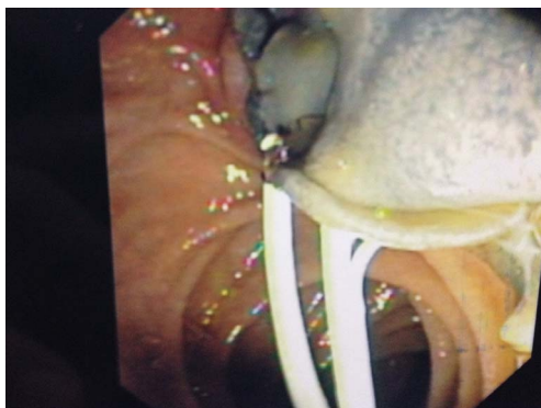
Figure 3. Closer view of Fasciola hepatica intact worm drained to the duodenum after endoscopic shinterotomy during ERCP.

because the infection was not prevalent before & the clinicians, surgeons & radiologists are still they not be familiar with the disease, in addition to the fact that its clinical & imaging features may simulate other hepatobiliary diseases [3,9].