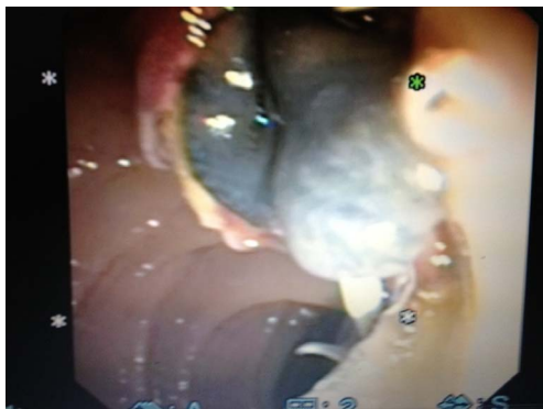
Figure 2. Closer view of Fasciola hepatica intact worm drained to the duodenum after endoscopic shinterotomy during ERCP.