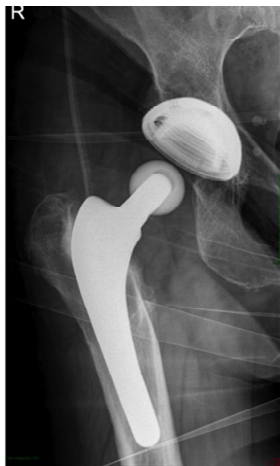
Figure 1. Radiograph of the dislocated THA.

revealing instability in deep flexion and endorotation. Afterwards the patient reports an intermittent crunch and unstable feeling. Radiography revealed neither ceramic debris nor signs of loosening. Due to the clinical symptoms a revision of the acetabular component was performed. On arthrotomy of the hip we noticed loosening of the ceramic component within the sandwich cup ( Figures 2(A) and (B) ). Flexion and endorotation of the hip resulted in motion in retroversion of the ceramic shell thus leading to a posterior dislocation of the hip. No signs of fracture or ceramic debris were seen. The liner could easily be removed and the Allofit shell revealed no signs of wear or loosening and had a stable fixation. A high wall all polyethylene liner was inserted. A 32 mm medium ceramic head was placed to augment stability ( Figure 3 ). Rehabilitation was initiated with full weight bearing and crutches were used as necessary. The patient was seen at 6 and 12 weeks post-operatively. A normal mobility of the hip was noted, no residual pain.