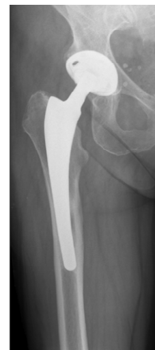
Figure 3. Radiograph of the revision THA.

version was necessary [2]. In a ten-year follow-up study by Park et al. 102 sandwich cup were reviewed [11]. Three revisions, one acetabular loosening and two liner fractures were reported. Their Kaplan-Meier survival probability at ten years was 95.3%. They state that ten-year results of cementless THA with a sandwich-type alumina ceramic bearing are encouraging. In the literature only a few case reports [10,12] and in the last few years retrospective reports have been published with rates of liner fractures in sandwich-type cups ranging from 2% to 18%. One case report has been published of a dissociation between the polyethylene and the metal shell [4]. The authors state that the failure mode is attributed to increased rotational torque secondary to peripheral wear. In a retrospective study by Lopes et al. , 353 ceramic-polyethylene sandwich liner acetabular components were reviewed [5]. Seven of these (2%) fractured at a mean of 4.3 years. No trauma or abnormal physical activity was observed; neither were there dislocations preceding liner fracture. Viste and coworkers published