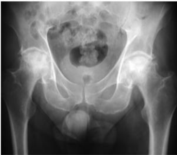
Figure 1. AP radiograph of the pelvis showing Ficat stage four osteonecrosis bilaterally.