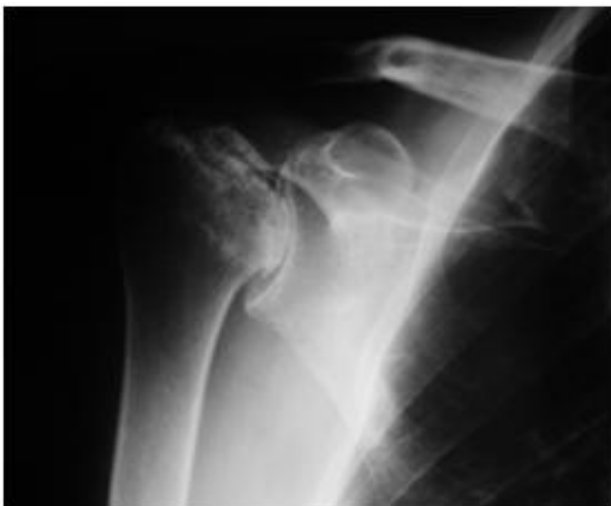
Figure 2. AP radiograph of the right shoulder showing osteonecrosis with collapse of the humeral head.

cumulative Dexamethasone dose of 32 mg. This equates to a cumulative Prednisolone equivalent dose of 4.4 grams. His peak Prednisolone dose was 45 mg in one day and his average daily Prednisolone dose over the period was 18mg per day. Six months following commencement of steroid therapy he was diagnosed with difficult to control Hypercholesterolaemia. At that time his cholesterol was approximately 8 mmol/L; it is currently controlled with Atorvastatin therapy.