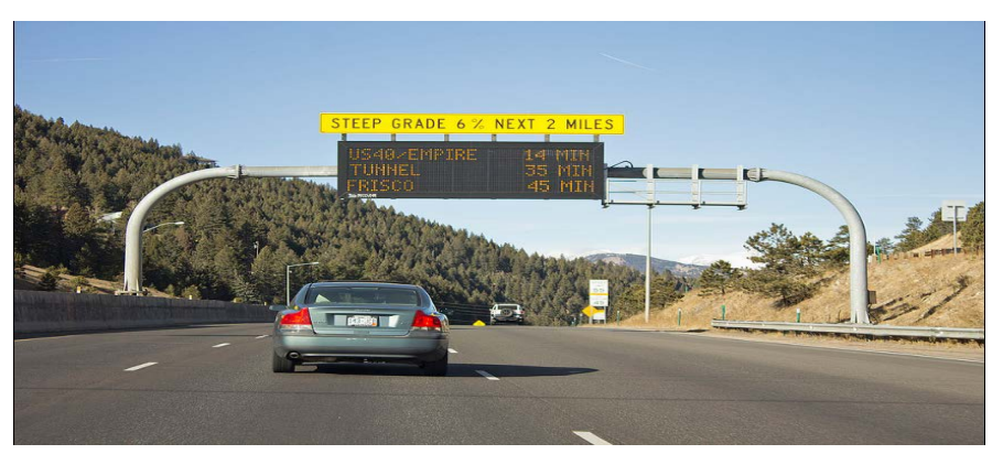
Figure 2. Graphical example of VMS.

A traffic light or traffic signal is a signaling device which is placed on a road