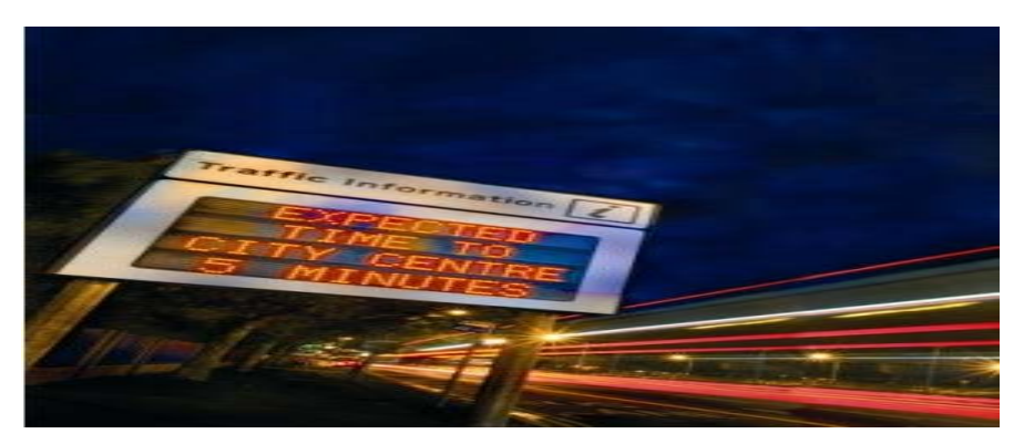
Figure 3. Illustration of the use VMS in enhancing in road traffic monitoring.

Figure 2. Graphical example of VMS.