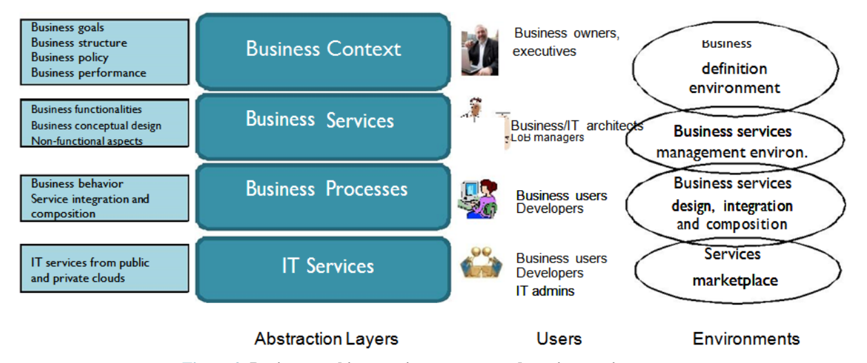
Figure 2. Business architecture in an outsourced services environment.

To analyze how the existing progresses in SOA, cloud computing and current standards and practices aid in realizing an online business working environment, and recognize the restrictions and tests. Note that in addition the novel and exclusive challenges posed by delivered and using services in the cloud, some of which is reviewed in the following, countless trials of understanding an online business working environment are connected to locating, constituting, assimilating and managing services. Most of